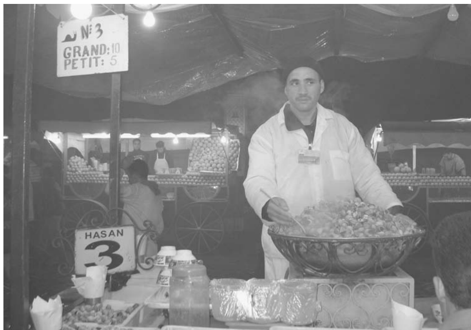
Stand selling snails in Marrakesh, Morocco, on Place Jamal El Fna.

The Kingdom of Morocco is located on the northwest coast of Africa separated from Spain by just 8 miles of the Mediterranean Sea. Together with Tunisia , Algeria , Mauritania , and Libya , Morocco is part of the Maghreb region and shares cultural, historical, linguistic, and culinary ties with these countries. In 1912, it was divided into a French and a Spanish protectorate and regained its independence in 1956.